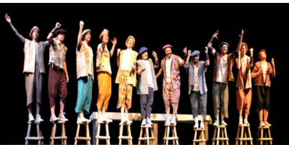
LaForge Encore Theatre “Joseph and the Amazing Technicolor Dreamcoat”